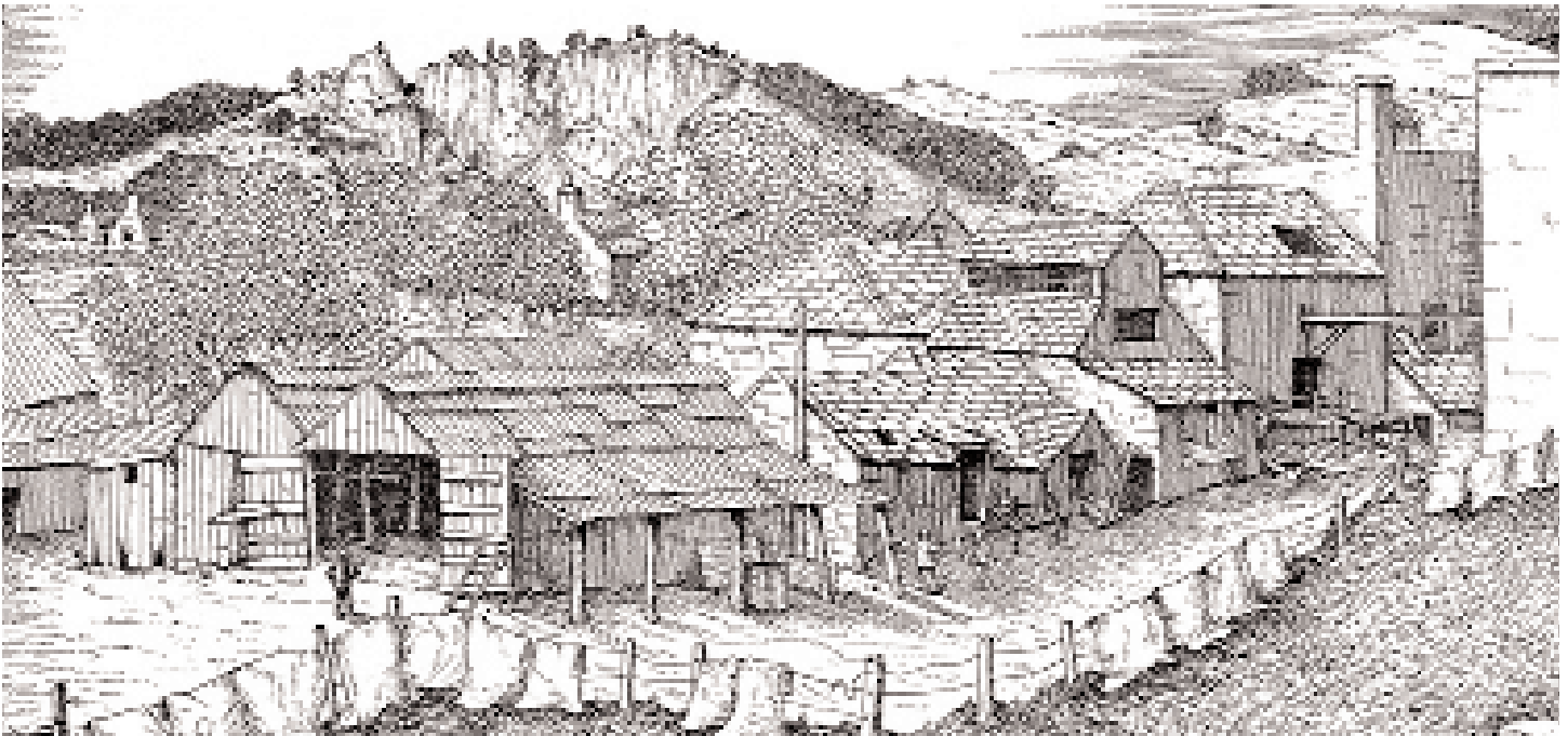
a sketch of the mill drawn in 1946 showing the old granite quarry in the background. The old wooden shed would be one of the originals. The building on the right was for Oatmeal production this was built circa 1940. The building on the left with the odd roof was the corn dryer.

16 Thursday. Finished the millstones and will work for a month now without any more repairs. I hear that our new publican T. McKnight is going off for England to be clerk to his wife's uncle. Gets £2.0 per week and a free house.